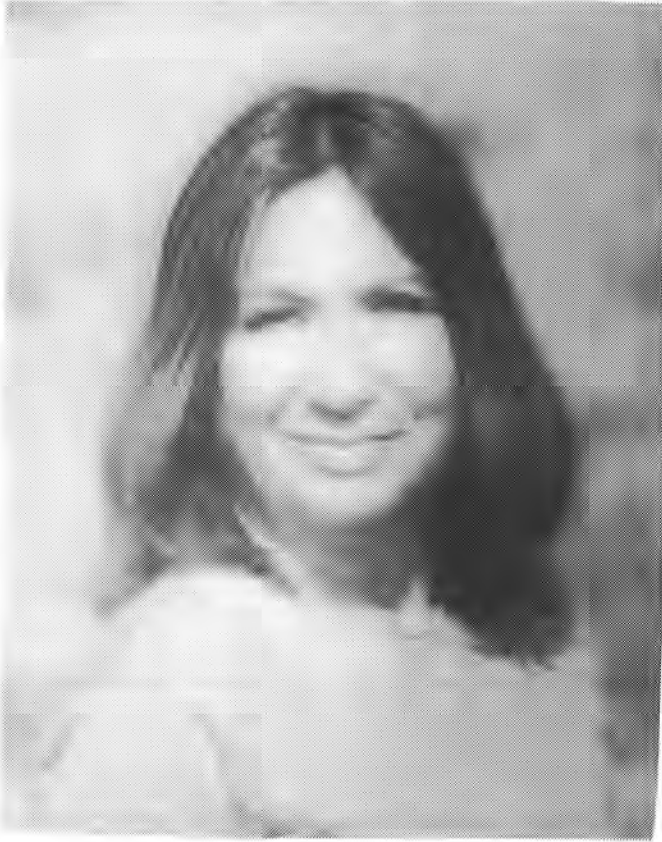
DREAMS WORKSHOP AT WRITER'S CONFERENCE